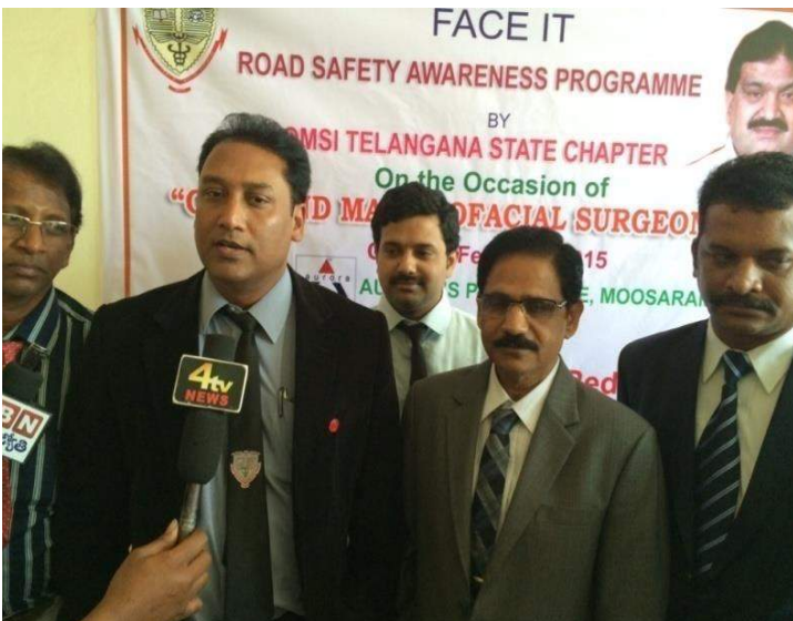
INAGURATION OF THE MAXILLOFACIAL SURGEONS DAY EVENT & PRESS MEET