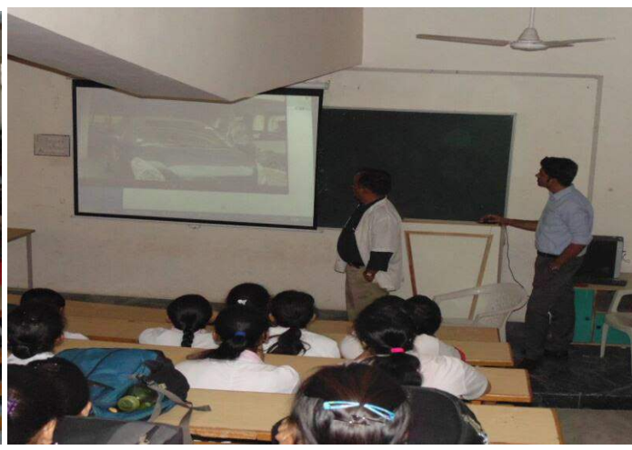
5<sup>TH</sup> ANNUAL CONFERENCE, 22<sup>nd</sup> & 23<sup>rd</sup> August