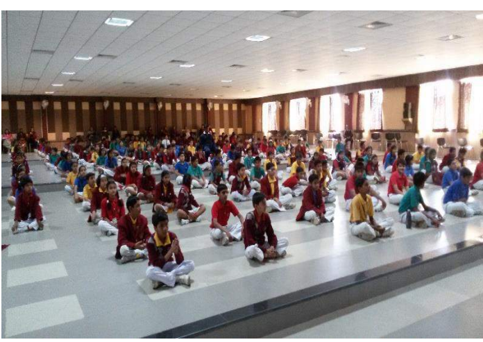
5<sup>TH</sup> ANNUAL CONFERENCE