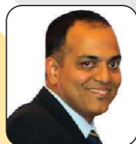
Hon. General Secretary