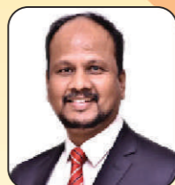
Hon. General Secretary