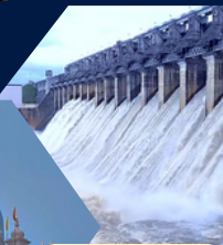
BARGI DAM, JABALPUR