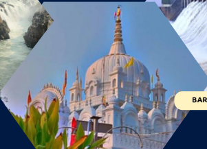
BANDAKPUR DHAM, DAMOH