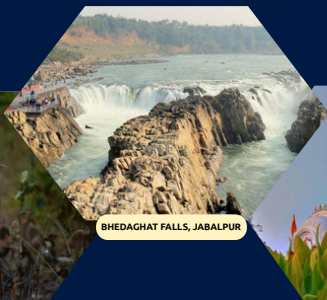
BHEDAGHAT FALLS, JABALPUR